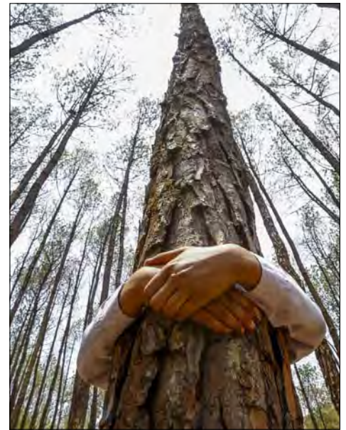
A Nepalese man hugs a tree while celebrating World Environment Day at the forest of Gokarna, on the outskirts of Kathmandu, in 2014.

11. What was the attitude of Jesus toward creation (96-100)?