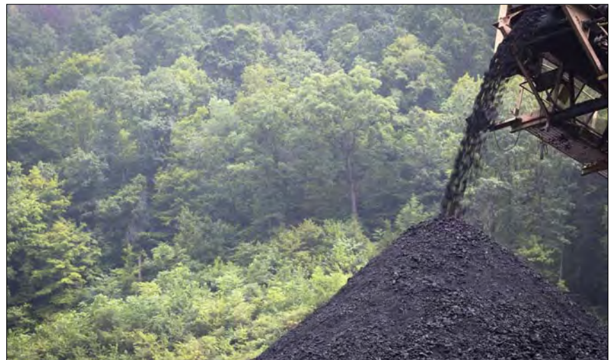
A mound of coal after being processed near Whitesville, W.Va., in August 2014