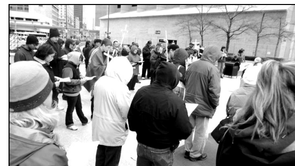
YPA Joins the Good Friday Walk through downtown Detroit.

Peace Action also awarded Young Peace Activists (YPA) with their organizational peace award.